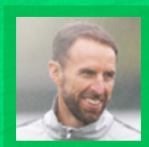
Gareth Southgate England Manager

I said before the tournament success would be that we have come back from Russia proud of what we have done. Though we would have liked to have gone further, we were proud of our performances and how we represented ourselves which is credit to the squad, the staff and the supporters for being part of that ‘anything is possible’ mind-set.”